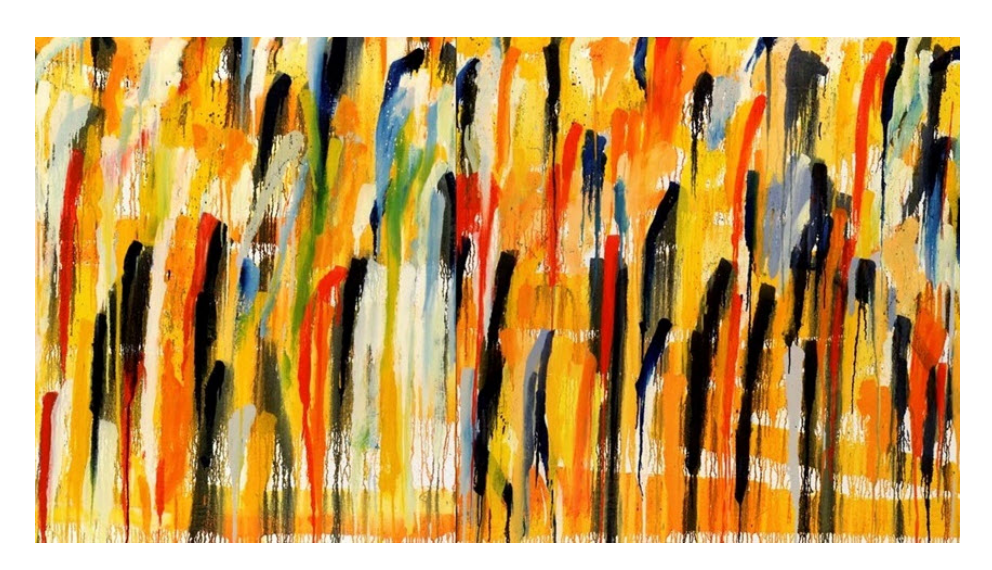
Pierre Coupey, Untitled XVIII (2016).

Exhibition: "Lynn Goldsmith (http://www.artnet.com/galleries/liss-gallery/lynn-goldsmith/)"