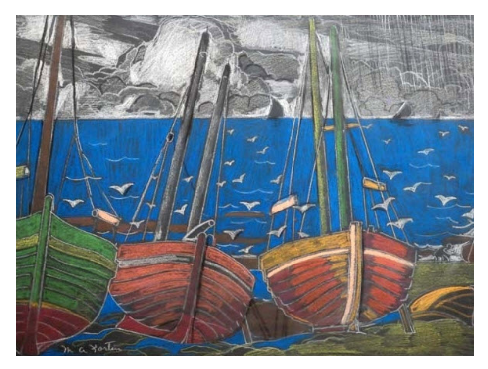
Marc-Aurèle Fortin, Les barques (1942).

migrate north—that being said, it shouldn't be the only reason why "Canada" and "how do I move to Canada" has spiked in Google searches. Art Toronto opens its doors tomorrow and, now in its 17th year, Canada's international art fair for Modern and contemporary art jam packs everything you want to see and know about the national art market. Art Toronto is held in the Toronto Convention Centre (not center!), but you shouldn't limit yourself to just the fair or even one city. Before it gets too cold to roam the streets, take this opportunity to experience the country's vibrant and diverse culture with its ever-growing arts scene: from established institutions to new ventures, metropolises like Toronto, Montreal, and Vancouver are making a major impact on the art world. After all, Canada isn't shy from bringing its creative talent down south, just think of our beloved <a href="mailto:Drake">Drake (https://news.artnet.com/art-world/james-turrell-on-drake-345518)</a>, Jeff Wall (https://news.artnet.com/art-world/jeff-wall-quits-marian-goodman-for-gagosian-584489), and <a href="Mike Myers">Mike Myers (https://news.artnet.com/market/leo-dicaprio-mike-myers-arnold-lehman-grace-vip-frieze-new-york-preview-297942)</a>. Vive Canada.