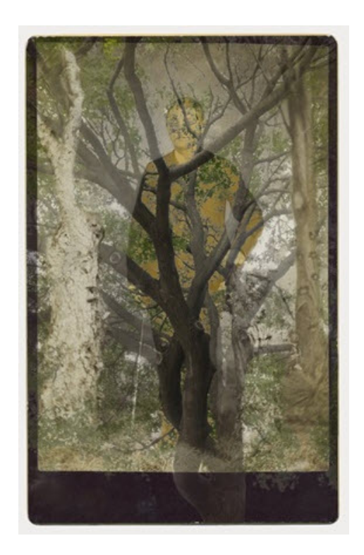
Sara Angelucci, Man/Maple (2016).

Exhibition: "Sara Angelucci Arboretum (http://www.artnet.com/galleries/stephen-bulger-gallery/sara-angelucci-