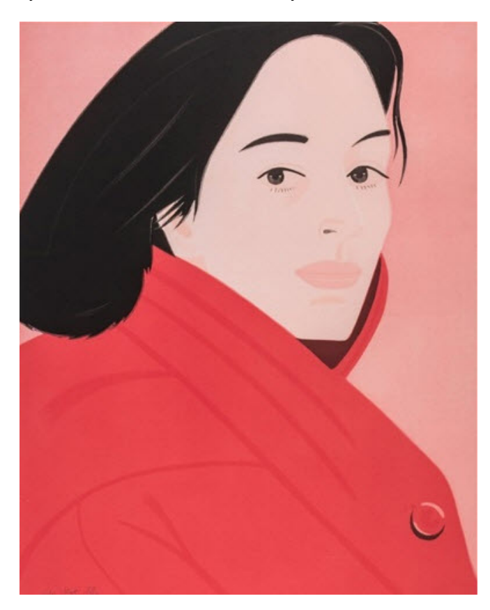
Alex Katz, Brisk Day II (1990).

Where: Oeno Gallery, 2274 County Road 1, Prince Edward County, ON, Canada