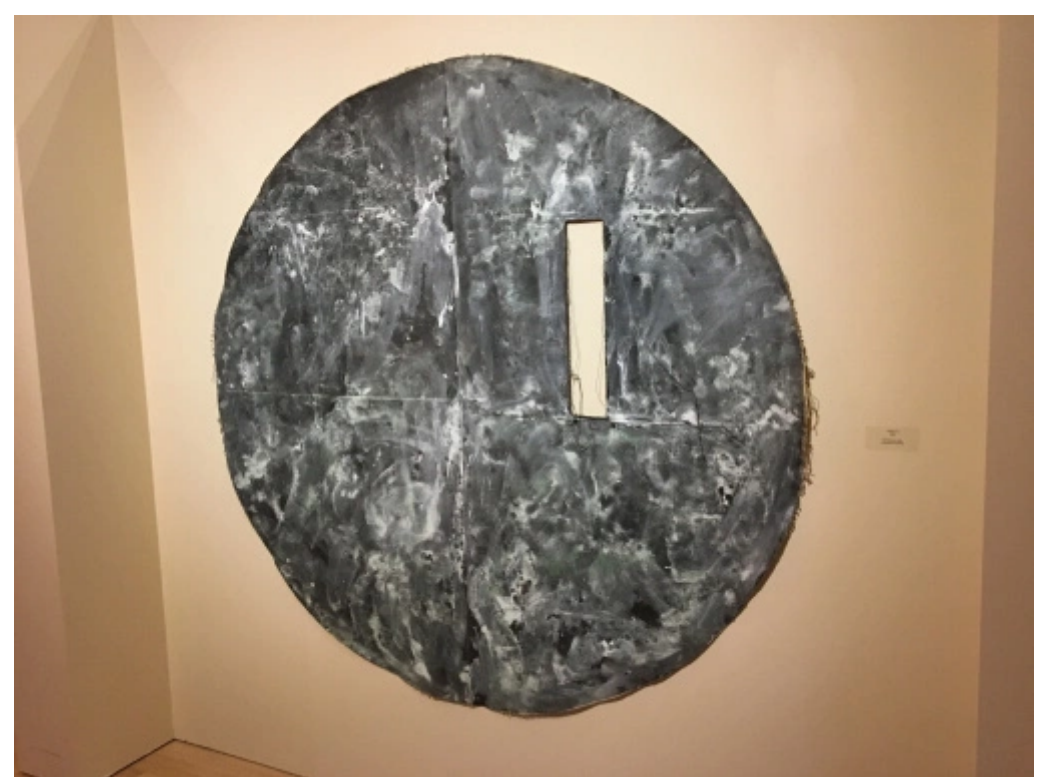
(https://abcrit.files.wordpress.com/2017/05/2-sullivan-1980-tondo-no-6.jpg) Françoise Sullivan, "Tondo no. 6", 1980, acrylic on canvas, 169 x 178 cm, collection of the artist