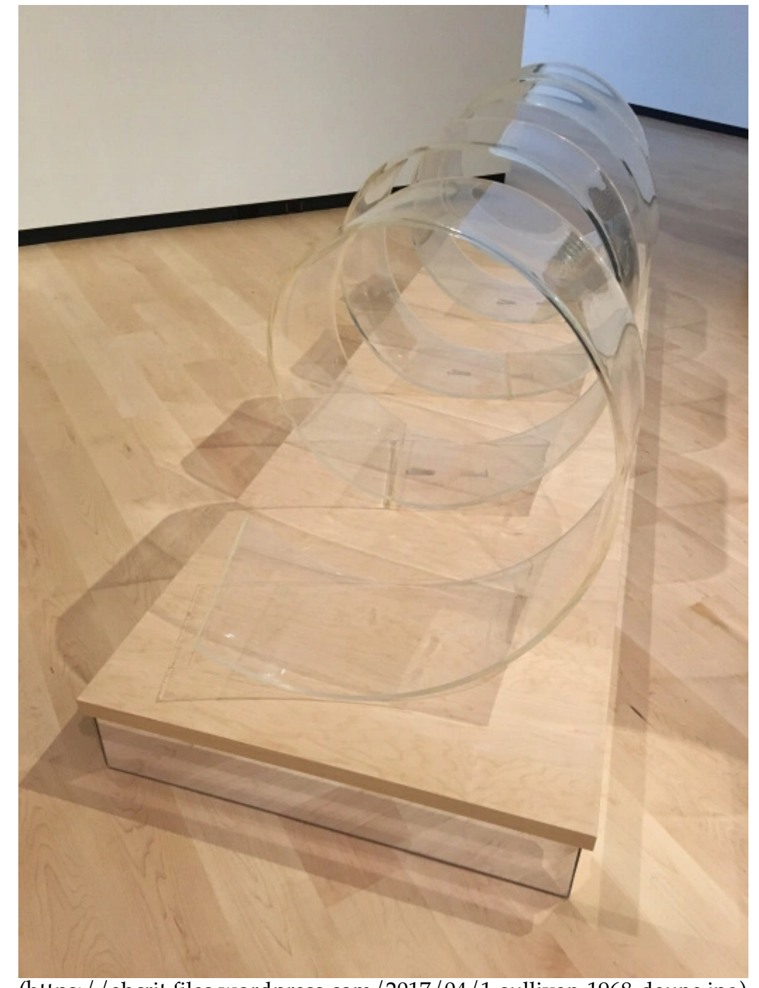
(https://abcrit.files.wordpress.com/2017/04/1-sullivan-1968-deune.jpg) Françoise Sullivan, "De une (Of One)", 1968-69, plexiglass, 72.5 x 278 x 74 cm; Musée national des beaux-arts du Québec

In the 1940s and early 1950s, Montreal was the pre-eminent centre for advanced art in Canada. The most important group there, Les Automatistes , emerged parallel to the Abstract Expressionists, although they were more inter-disciplinary and more political than their New York contemporaries. Think of their provocative and influential manifesto, Refus global (1948), which is often credited with furthering Quebec's advance into the more modern era of the "Quiet Revolution." While their leading figure, Paul-Emile Borduas, exiled himself to New York in 1953 and then Paris in 1955, where he died prematurely in 1960, several titans of Les Automatistes continued to re-invent themselves for a surprisingly long time, most notably Pierre Gauvreau (1922-2011), Marcel Barbeau (1925-2016) and Francoise Sullivan (1925-). The vitality of Sullivan's current work is a striking reminder of the importance of this still underappreciated movement.