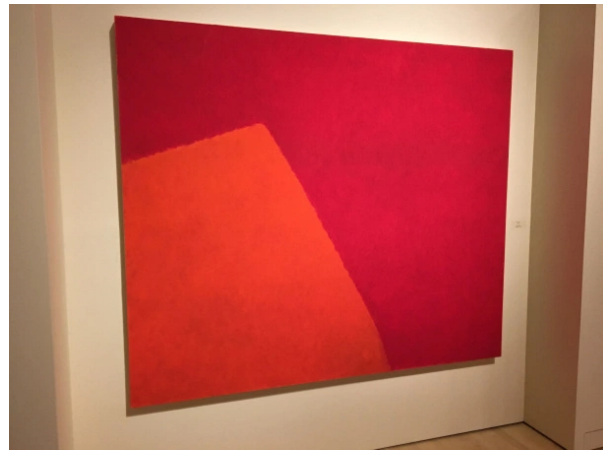
(https://abcrit.files.wordpress.com/2017/05/5-sullivan-2010-rouges-no-3.jpg). Françoise Sullivan, "Rouges no. 3 (Reds No. 3)", 2010, oil on canvas, 167.5 x 198 cm, collection of the artist: photo Ken Carpenter

The Rouges series was well represented also. One might not expect a painting of such limited means as Rouge no. 3 (2010) to be as affective as it is. Two simple shapes. A mere two colours. A generally uniform écriture so understated as to be scarcely noticeable. Perhaps two emotional tones, that of the bottom left more ebullient than that at the top . Yet it has tensions, pressure. One gets a sense of envelopment, perhaps even of insertion.