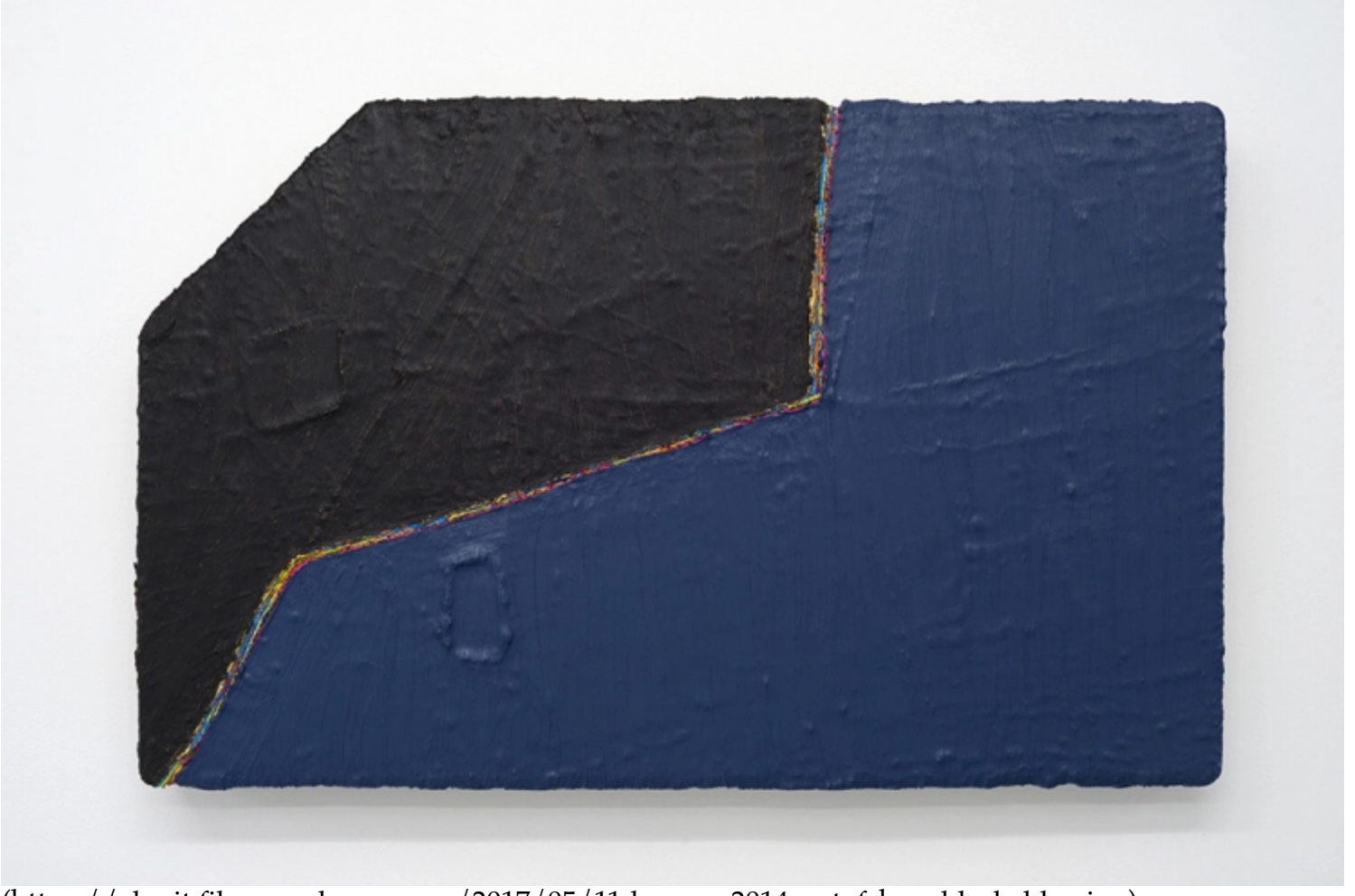
(https://abcrit.files.wordpress.com/2017/05/11-bureau-2014-outofshapeblack_blue.jpg) Paul Bureau, "Out of Shape (black/blue)", 2014, 66 x 104cm, collection of the artist: photo Guy L'Heureux